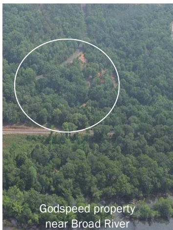
Godspeed property near Broad River

Missionaries often work countless hours under extreme conditions. Research has shown that 50% return from the field before the end of their first term (Stearns, 2006). This can be for a variety of reasons such as family illness or burnout. Political unrest is but one example of what they may face on the field. Just as those in combat, missionaries may need debriefing to prevent post-traumatic stress disorder or other effects.